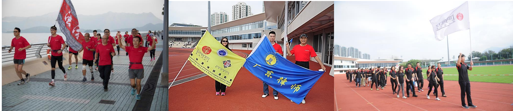
(Past event photos)