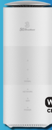
3HK 5G CPE 5