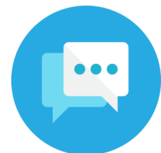
Redaction & Annotations