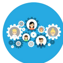
Secure Share & Collaboration