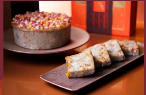
Hung Tong Taro Pudding 紅糖秘製芋頭糕 Original Price HKD338 / Discount Price HKD253.5