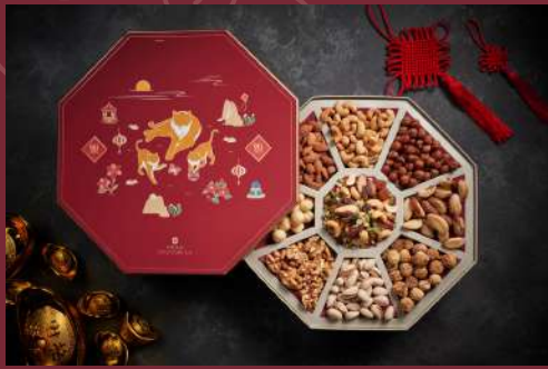
Shangri-La Prosperity Premium Assorted Gift Box (9 types of Nut and Dried Fruit) 香格里拉福虎踏春賀年禮盒 (九款果仁及乾果) Original Price HKD698 / Discount Price HKD558.4