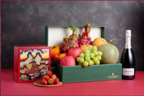
Shang Palace Deluxe Fruit Hamper 香宮豪華水果禮物籃 Original Price HKD2,288 / Discount Price HKD1,830.4