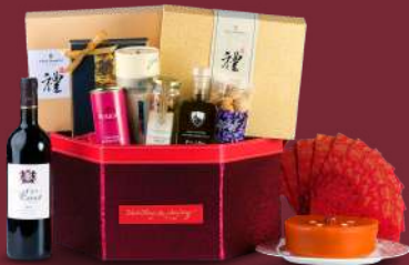
Summer Palace Ruby Hamper