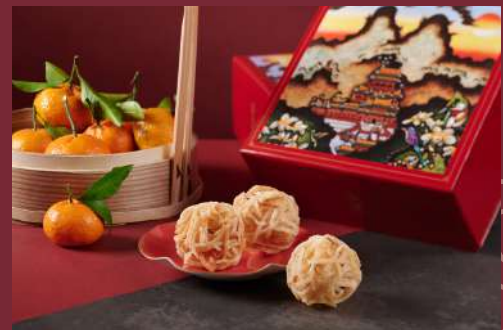
Crispy Taro Balls with Sesame (8 pieces) 賀年芋蝦 (八粒裝)

Original Price HKD568 / Discount Price HKD426