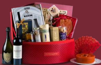
Summer Palace Platinum Hamper