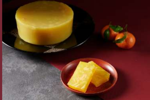
Water Chestnut Pudding 鳳凰馬蹄糕

Original Price HKD338 / Discount Price HKD253.5