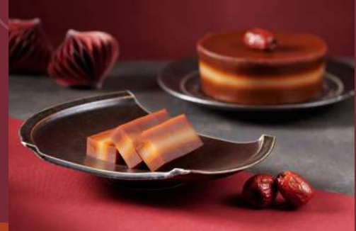
Red Date Pudding with Ginger and Brown Sugar 薑汁黑糖棗皇糕

Original Price HKD338 / Discount Price HKD253.5