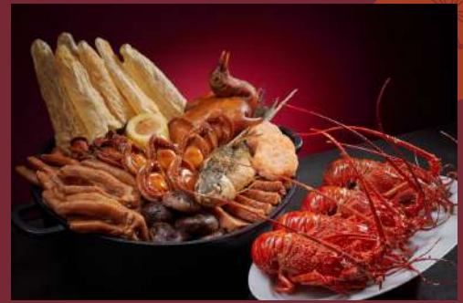
Shang Palace Michelin-Starred Chef Recommendation Luxury Poon Choi (for 6 to 8 persons) 香宮米芝蓮星級大廚推介豪華盆菜 (可供六至八位享用) HKD4,388