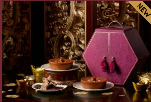
Summer Palace Michelin-Starred Chinese New Year Pudding with 80-Year Dried Tangerine Peel Duo Gift Box

Original Price HKD558 / Discount Price HKD446.4