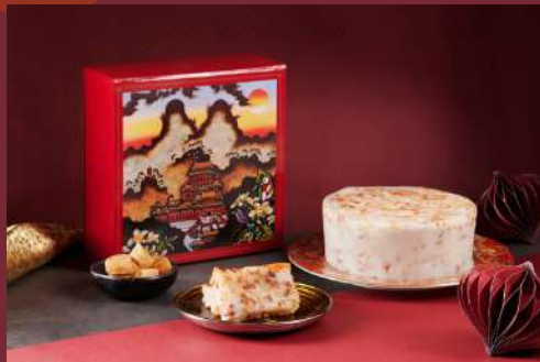
Signature Turnip Pudding 臘味蘿蔔糕

Original Price HKD338 / Discount Price HKD253.5