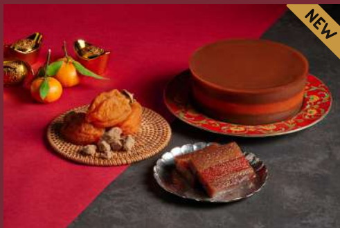
Japanese Brown Sugar Pudding with Dried Persimmon 日本黑糖柿乾年糕

Original Price HKD388 / Discount Price HKD291