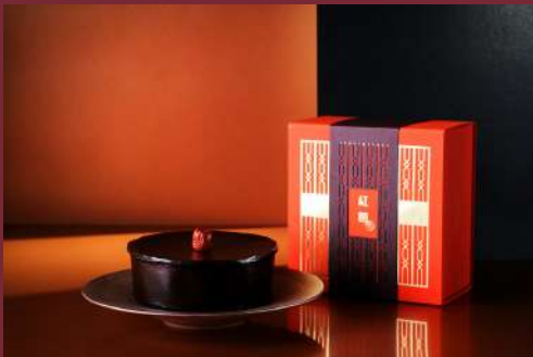
Hung Tong Traditional Chinese New Year Pudding 紅糖傳統年糕 Original Price HKD328 / Discount Price HKD246