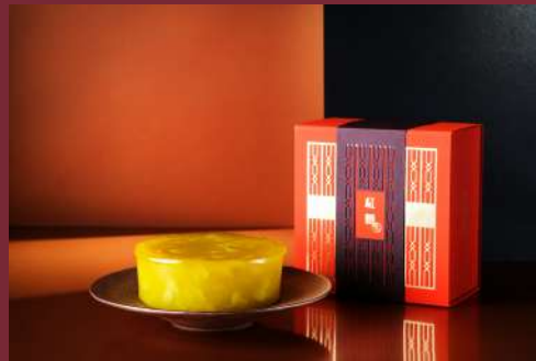
Hung Tong Water Chestnut Pudding 紅糖馬蹄糕 Original Price HKD328 / Discount Price HKD246