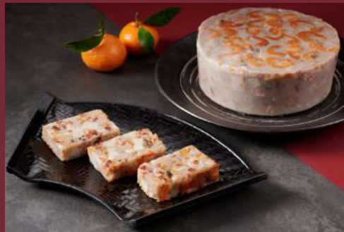
Signature Taro Pudding 臘味芋頭糕

Original Price HKD358 / Discount Price HKD268.5