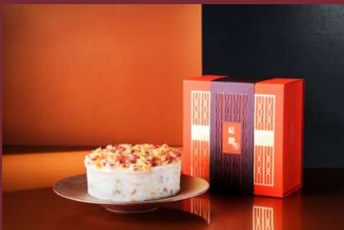
Hung Tong Deluxe Conpoy Turnip Pudding 紅糖至尊瑤柱蘿蔔糕 Original Price HKD338 / Discount Price HKD253.5