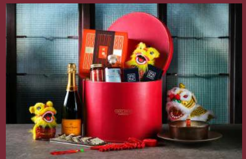
Hung Tong Chinese New Year Hamper 紅糖賀年精選禮物籃 Original Price HKD1,888 / Discount Price HKD1,510.4