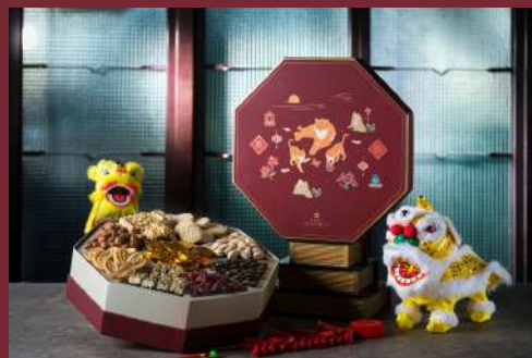
Shangri-La Prosperity Premium Assorted Gift Box (Deluxe Chinese New Year Candy Box) 香格里拉福虎踏春賀年禮盒 (精選賀年全盒) Original Price HKD388 / Discount Price HKD310.4