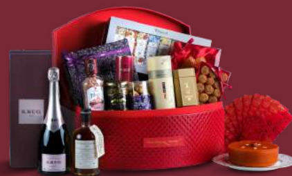
Summer Palace Golden Jubilation Hamper

Original Price HKD6,188 / Discount Price HKD4,950.4