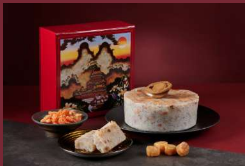
Turnip Pudding with Whole Abalone and Black Truffle 原隻鮑魚黑松露蘿蔔糕

Original Price HKD388 / Discount Price HKD291