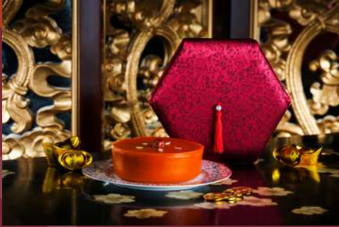
Summer Palace Chinese New Year Pudding