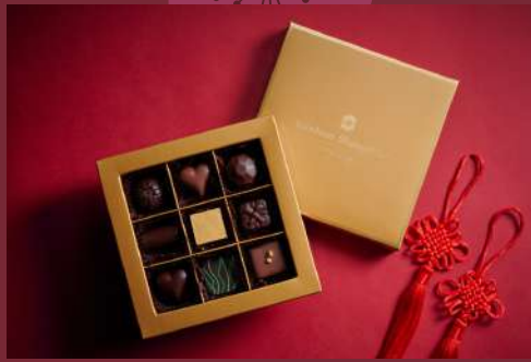
Chinese New Year Chocolate Pralines (9 pieces) 賀年精選朱古力禮盒 (九粒裝) Original Price HKD198 / Discount Price HKD158.4