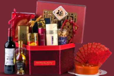
Summer Palace Diamond Hamper

Original Price HKD3,588 / Discount Price HKD2,870.4