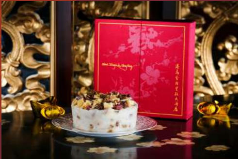
Summer Palace Turnip Pudding with 88-month Ibérico Ham, Emmental Cheese and Morel Mushroom

Original Price HKD328 / Discount Price HKD262.4