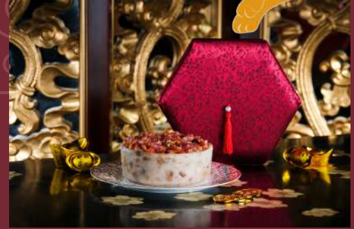
Summer Palace Taro Pudding

Original Price HKD328 / Discount Price HKD262.4