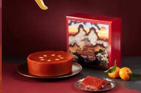
Chinese New Year Pudding 椰汁年糕

Original Price HKD338 / Discount Price HKD253.5