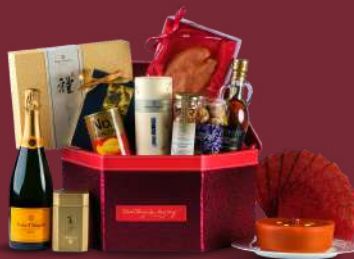
Summer Palace Jade Hamper

Original Price HKD2,788 / Discount Price HKD2,230.4