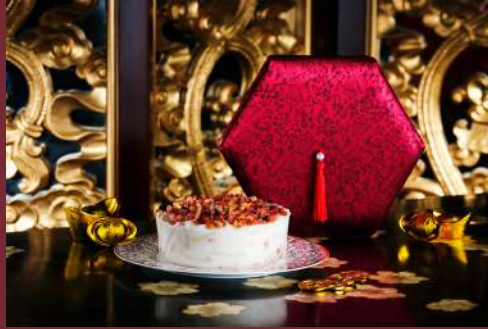
Summer Palace Turnip Pudding

Original Price HKD328 / Discount Price HKD262.4