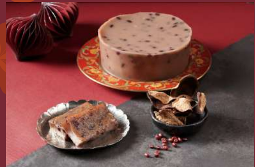
Red Bean Pudding with 30-Year Tangerine Peel 三十年陳皮紅豆年糕

Original Price HKD358 / Discount Price HKD268.5