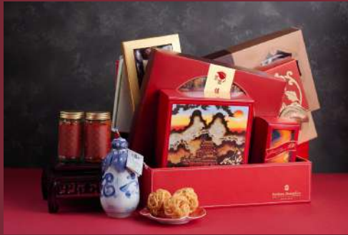
Shang Palace Chinese New Year hamper 香宮豪華禮物籃 Original Price HKD3,088 / Discount Price HKD2,470.4

6-Head African Abalone, Coddled Fish Maw, Stuffed Marrow Ring with Conpoy, Poached Young Lobster, Hua Dao Pigeon, Sun-Dried Oysters, Pan-Fried Boneless Stuffed Fish, Braised Goose Webs with Oyster Sauce, Sliced Pork Belly with Red Bean Curd Sauce, Pan-Seared Shrimp Patties, Bean Curd Sheet with Chu Hou Paste, Braised Black Mushrooms, Poached Tientsin White Cabbage, Sliced Taro with Spice, Braised Black Moss, Poached Turnips