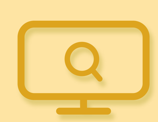
Hong Kong Research Platform

Enabling users to quickly locate their required information and streamline their research process by filtering by judges' name, representation, timeline, and/or by court, and contract templates