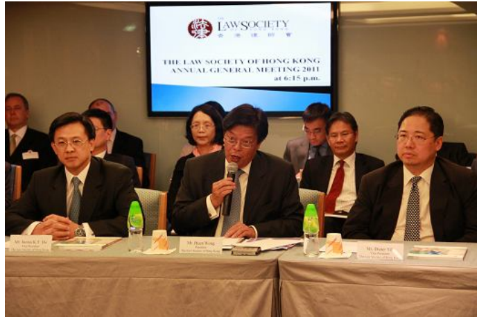
Law Society AGM on 26 May