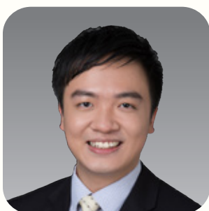
CHEUNG POK MAN VITUS LAWYERS