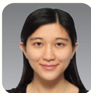
TSE WINNIE SINOPEC CENTURY BRIGHT CAPITAL INVESTMENT LIMITED